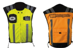
Teknic Kicker Vest (2 colour options)

Macna also have two jackets in their range that come with zips for attaching their zip on vision safety vest . This vest fits the Summit Jacket and the ladies Jade jacket. Come in and see the guys at MCR for that best suit you.