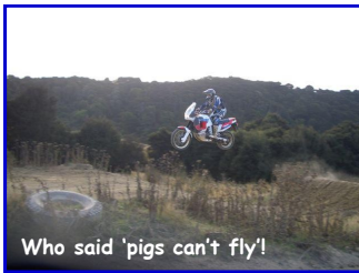
Who said 'pigs can't fly'!